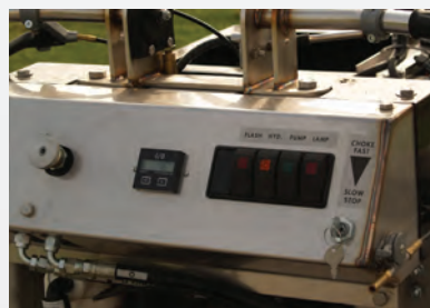
EZ Rider control panel

The EZ Rider is the perfect solution for areas that require tight turning radius and “hard to get to” spots. The center pivot allows the operator to effortlessly maneuver through narrow spaces as they go about their work. The EZ Rider is small enough to fit through a 36 inch gate opening and turn in a 13 foot turning radius.