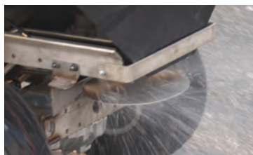
Spreading granular de-icing chemicals