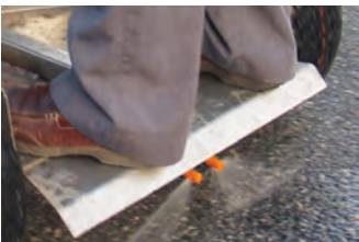
Anti-icing before event