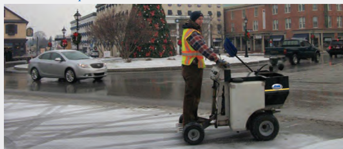
EZ Rider being utilized by the borough of Gettysburg, PA